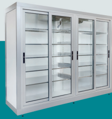
縦型陳列ケース vertical display-cases