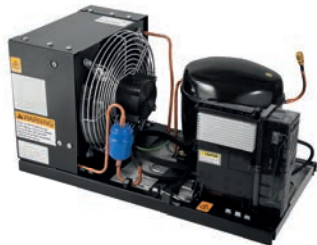
Inverter Version Options in 115 V and 220 V