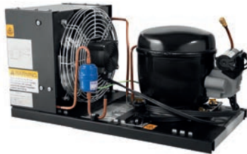
Bare and Compact Version